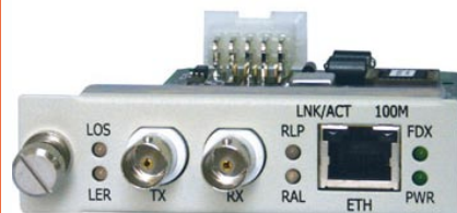
RC952-FEDS3/E3 Fast Ethernet over DS3/E3 Interface Converter