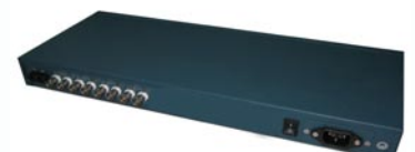
RC831-120 rear panel