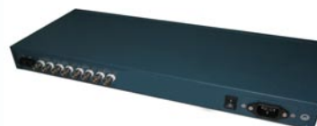
RC831-120 rear panel