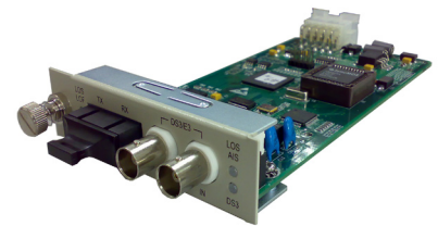
RC802-DS3/E3 Fiber Modem

and diagnoses in GUI of Raisecom self-designed network management software NView NNM. As to remote side Raisecom also provides unmanaged one slot chassis RC001-1 and 4-slot chassis RC001-4 which can accompany with RC802-DS3/E3 module for cost effective application. On front panel it has one unbalanced BNC interface which can be configured to DS3 or E3 by dip-switch. Because of the private protocol in optical port this modem can only be used point-to-point with a same RC802-DS3/E3 module.